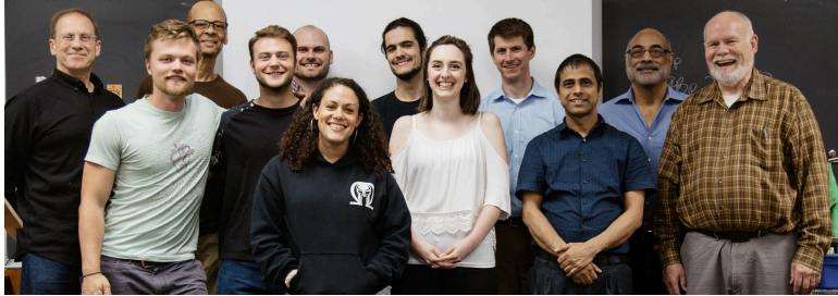
MBS' first Urban Ministry cohort, 2018