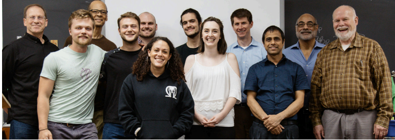
MBS' first Urban Ministry cohort, 2018