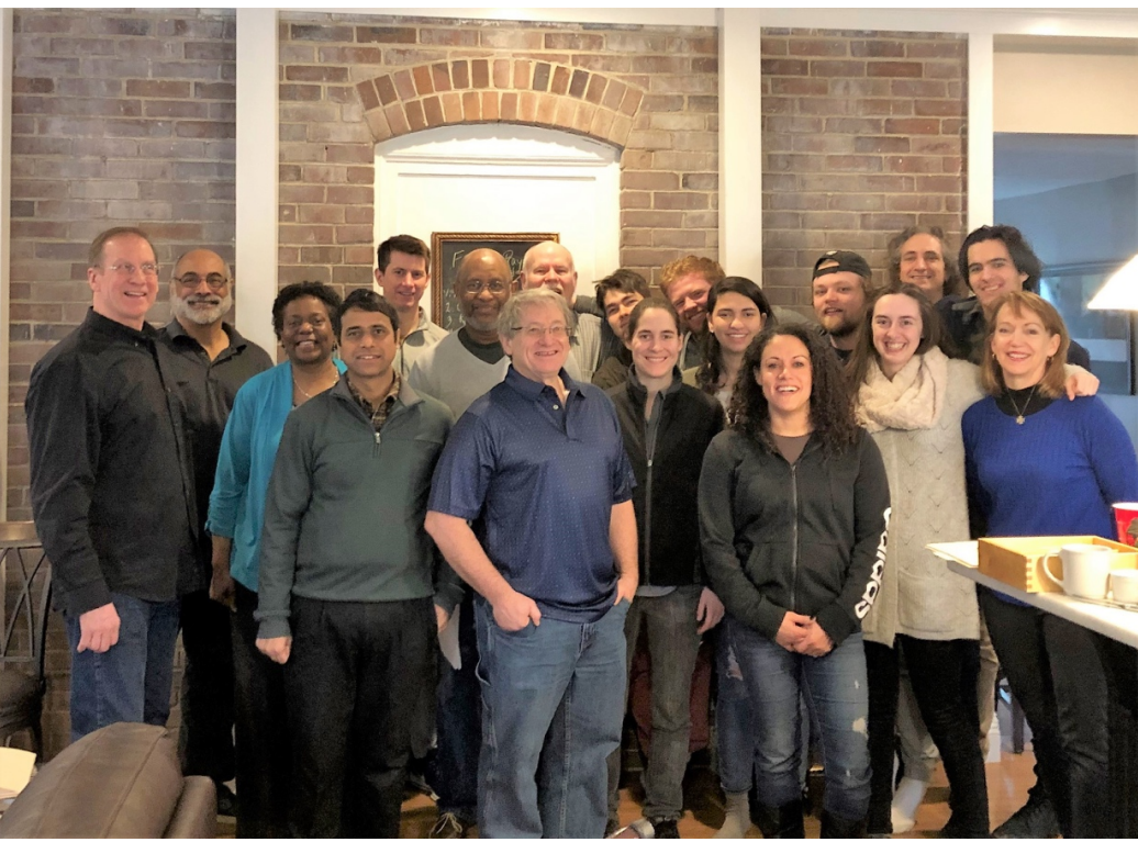
Church Planting & Renewal Track Cohort (with Urban Ministry Cohort) in Baltimore, Maryland